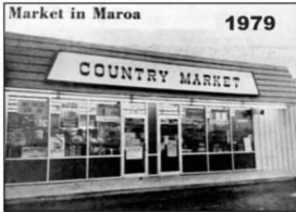
502 S Wood St Originally Country Market, then Huck's, then Coastal, then Lara's Pantry. Currently empty.