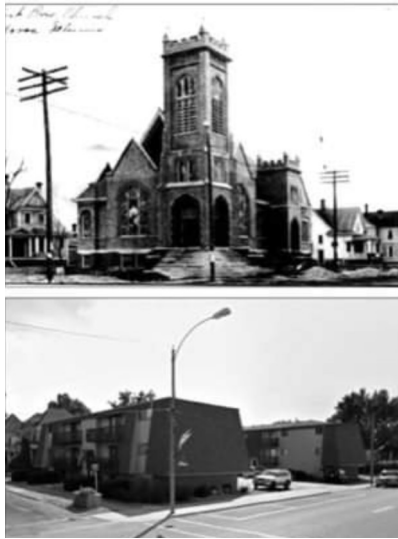
101 W Main