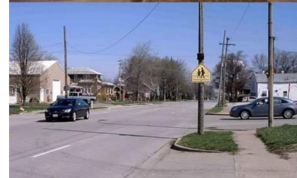
Wood and Main Street Looking North