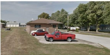
Old ICRR depot then, Top Flight Grain office now!!