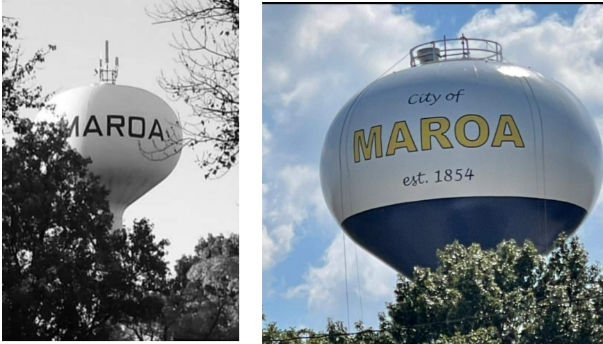
Our Town Water Tower!!!